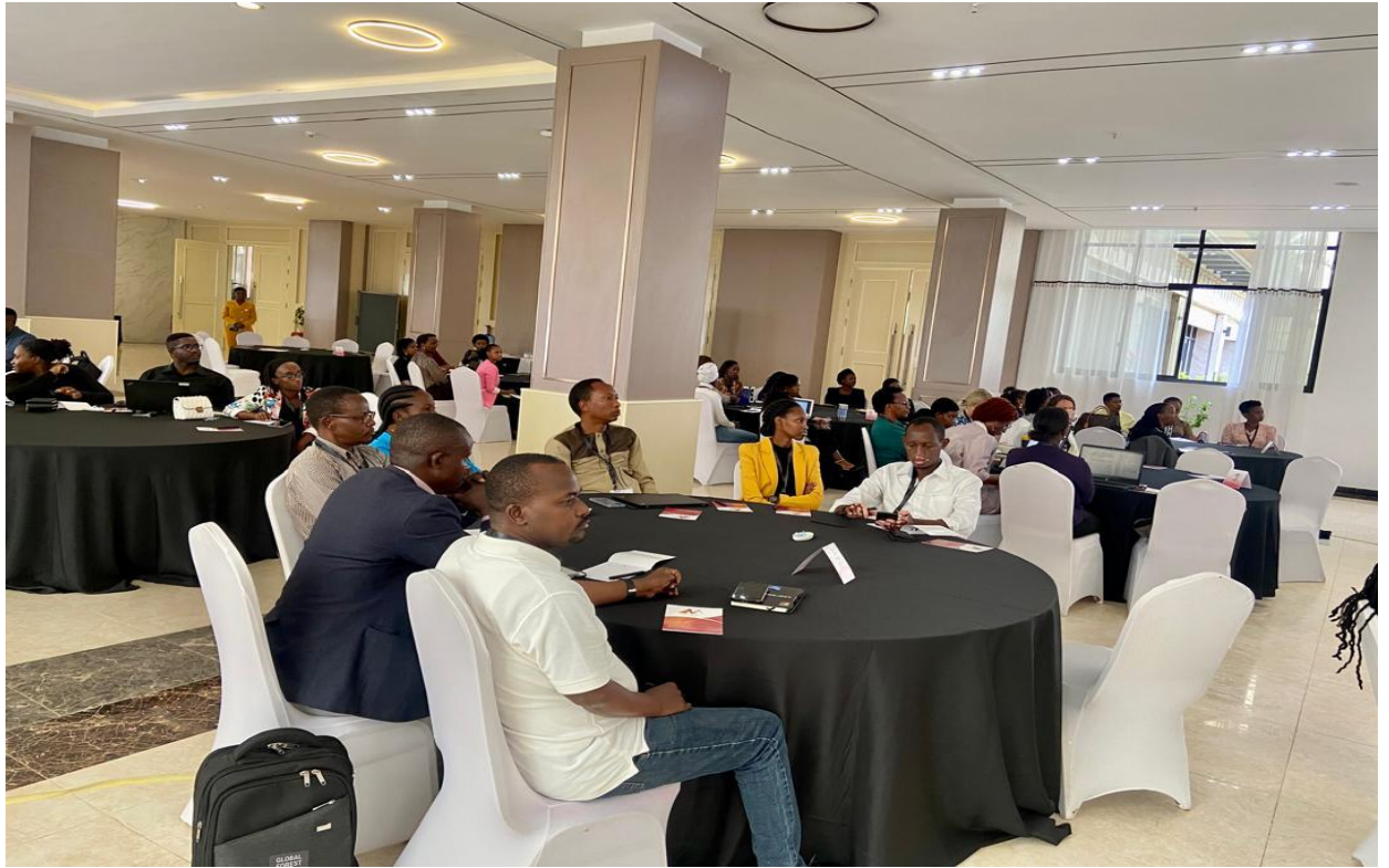
Photo of group work